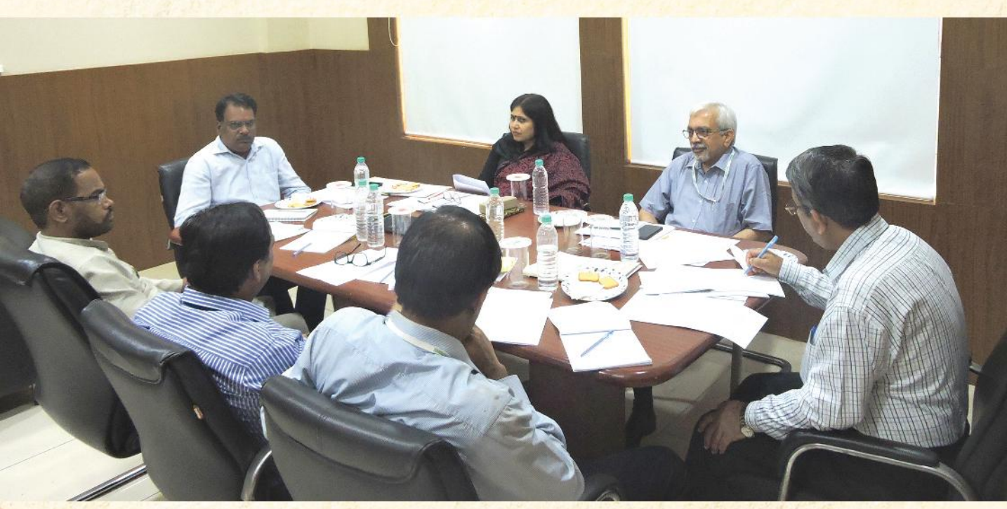
Discussions on International Internship

The MBA (Rural Management) Programme is designed to balance academics with both classroom and experiential learning. The two important components of the programme include Class Room Segments (CRSs) spread over 64 credits and, three Field Work Segments (FWSs) of 28 credits across four semesters over two years. The students spend almost 28 weeks in the three field segments which are designed to achieve progressive experiential learning. The Action Research Segment (ARS) in the first semester is followed by Case Study Research Segment(CSS) in the second semester, and Management Traineeship Segment (MTS) in the third semester.