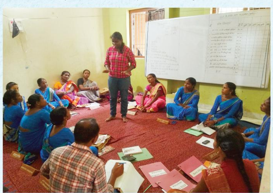
Student Interaction at Field Study Segments